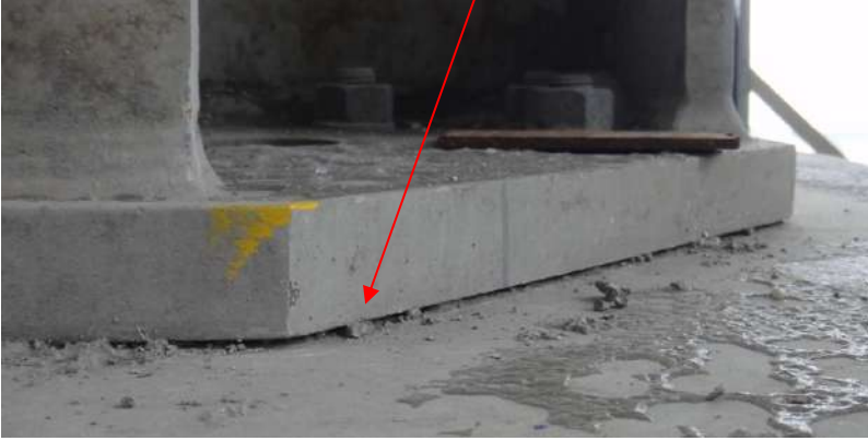
Insufficient materials do not distribute the load evenly and do not protect the steel structure from corrosion.